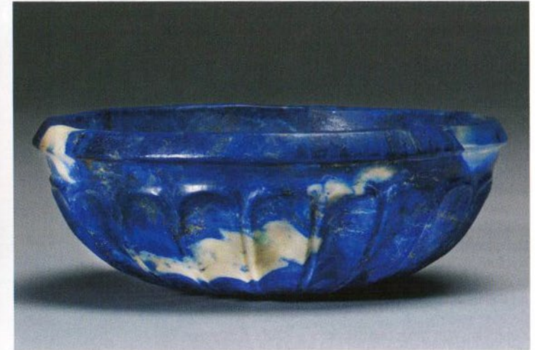
Achaemenid lapis lazuli bowl, Iran, 5th/4th century BC, 9.5 x 2.5 cm