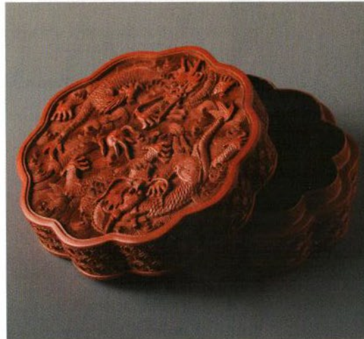
Foliolate lacquer box and cover, Qing dynasty, 18th century, diam. 10 cm, Vanderden Oriental Art

• From 30 September to 3 October, Hong Kong Convention and Exhibition Centre, Hong Kong, fineartasia.com