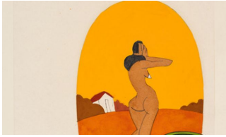
'A Survey of Sculptures and Drawings - 1959-2006' at Hauser+Wirth ( http://hk.blouinartinfo.com/news/story/1852975/a-survey-of-sculptures-and-drawings-1959-2006-at-hauser-wirth )

( http://hk.blouinartinfo.com/news/story/1600628/sneak-peek-2016-fine-art-asia-international-art-fair )