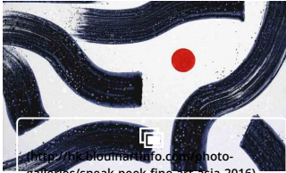
Sneak peek fine art asia 2016 ( http://hk.blouinartinfo.com/news/story/1582002/sneak-peek-10-incredible-pieces-at-fine-art-asia-2016 )