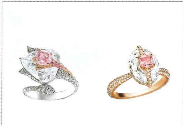
Pink Diamond Kissing Ring

A highlight at Fine Art Asia 2016 is the pink diamond and diamond kissing ring, made of 18 carat white gold. This lavishly crafted ring is designed with a brilliant cushion-shaped purplish pink diamond, also a 5 carat pear-shaped old-cut diamond, sitting on a bed of delicate purplish pink and white diamonds.