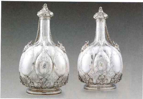
Georgian Pilgrim Flasks (George IV, London, 1828)

Fine Art Asia has established itself as Asia's leading international fine art fair to art, antiques over last ten years. The fair is returning this October showcasing 3 categories: Antique Silver, Fine Jewellery and Timepieces; Exceptional Museum-Quality Antiques; Impressionist, Modern and Contemporary Art. In 2015, these fine art pieces displayed a total of HK$ 2.8 billion of art worth and more than 6,500 outstanding works, attracting 25,800 visitors including dealers, collectors, curators and art lovers from all around the globe.